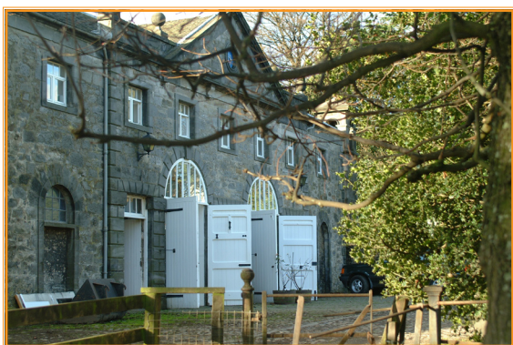
Edinburgh School of Food and Wine

THE EDINBURGH SCHOOL OF FOOD and Wine will shortly be celebrating 25 years of providing specialist cookery courses in the picturesque setting of Newliston House, just outside Edinburgh. The School caters for home and international students and offers a wide range of courses, from a six month full-time Diploma in Food and Wine, to one day courses in association with Glenfiddich Whisky and Veuve Cliquot Champagne.